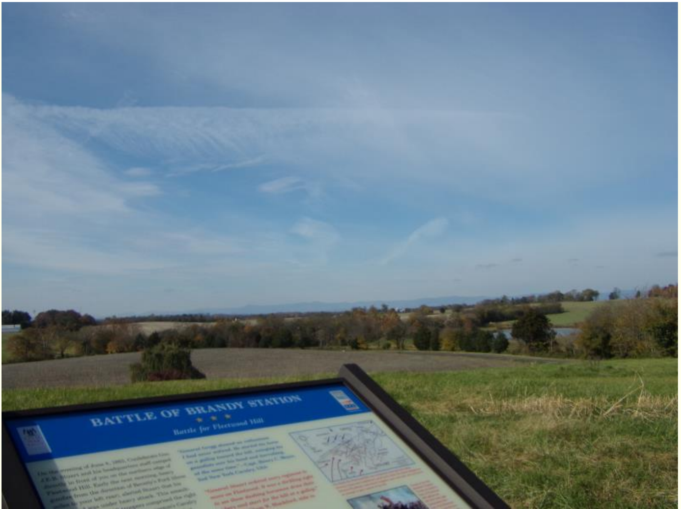
Battle of Brandy Station Marker on Fleetwood Hill

The BSF is presenting a series of two-hour tours, one devoted to each of the four engagements that comprise the Battle of Brandy Station.