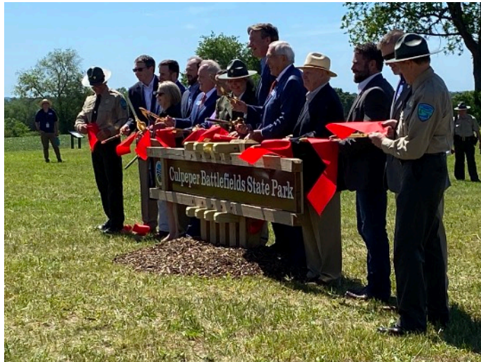
Ribbon Cutting for Culpeper Battlefields State Park on Fleetwood Hill, Brandy Station