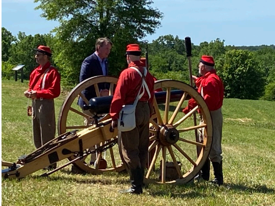
Governor Youngkin participated in the firing of a cannon at Culpeper Battlefields State Park

hard work in making the Culpeper Battlefields State Park at Brandy Station a reality.”