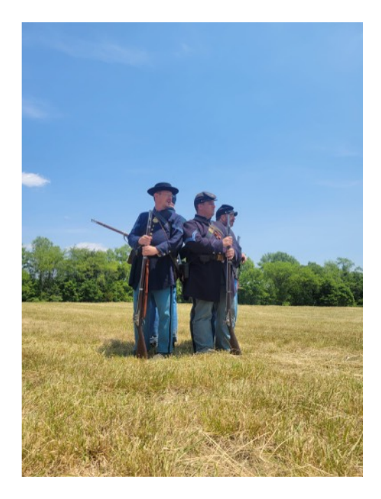
24th New York State Volunteers, Co. B on the Brandy Station battlefield and setting up camp across from the Graffiti House