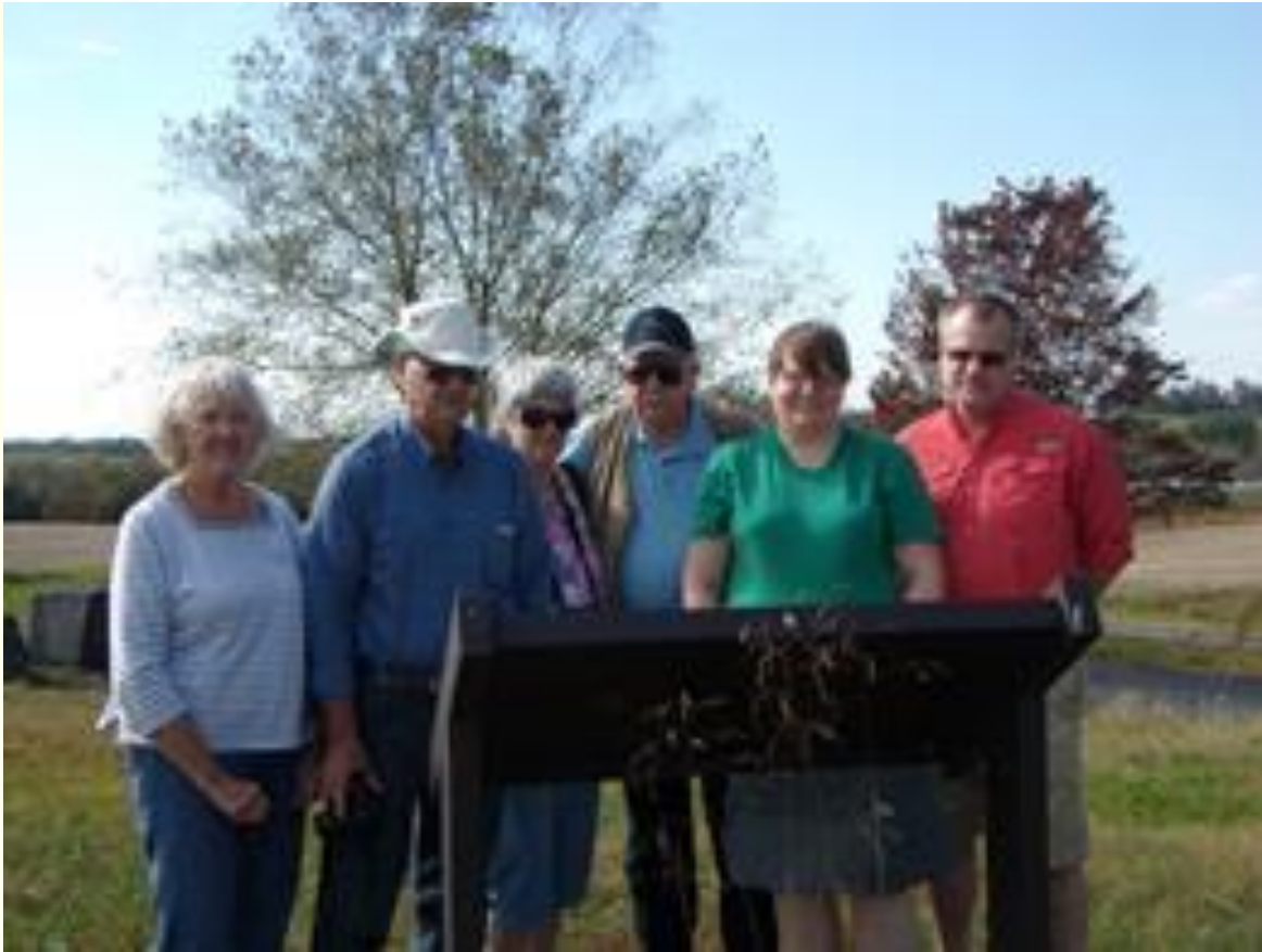
The Bowman family on Fleetwood Hill