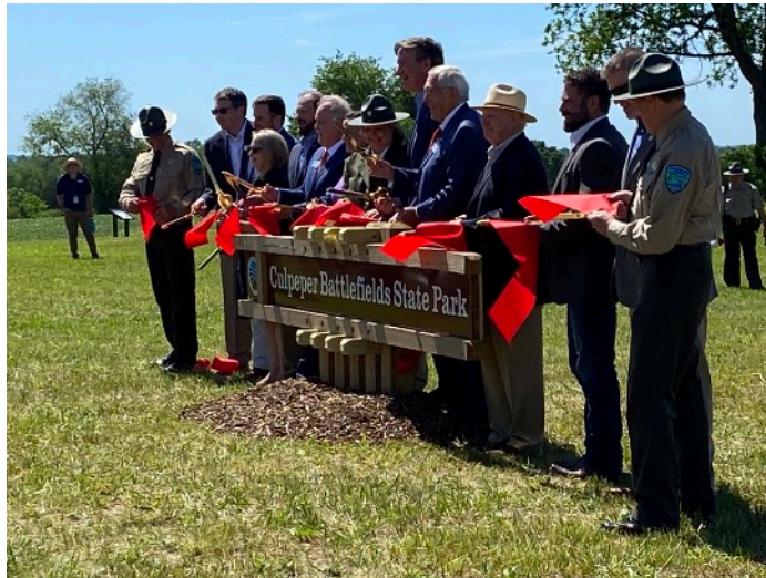
Ribbon Cutting for Culpeper Battlefields State Park on Fleetwood Hill, Brandy Station