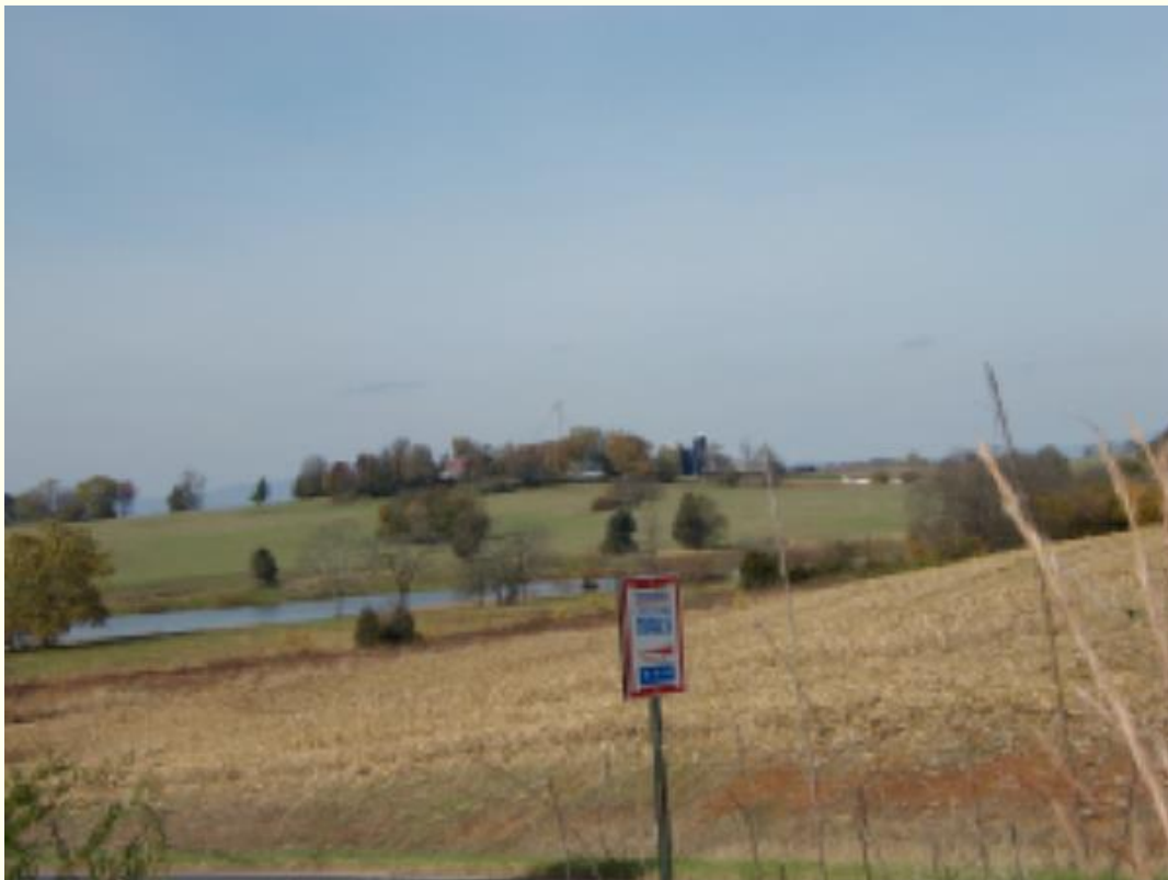
View of Beauregard Farm and Blue Ridge Mountains from Fleetwood Hill