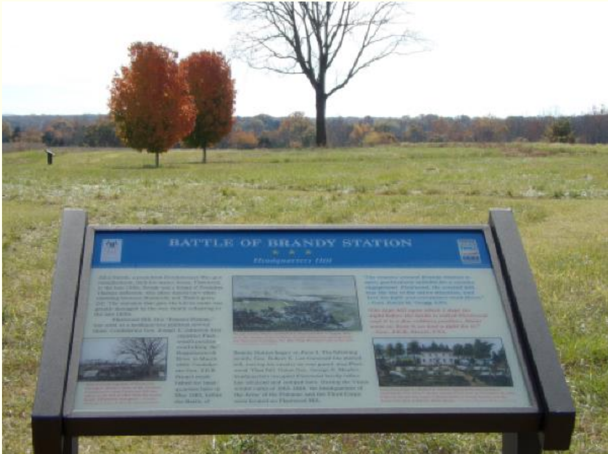
One of the new markers on the Civil War Trust Fleetwood Hill Interpretive Trail