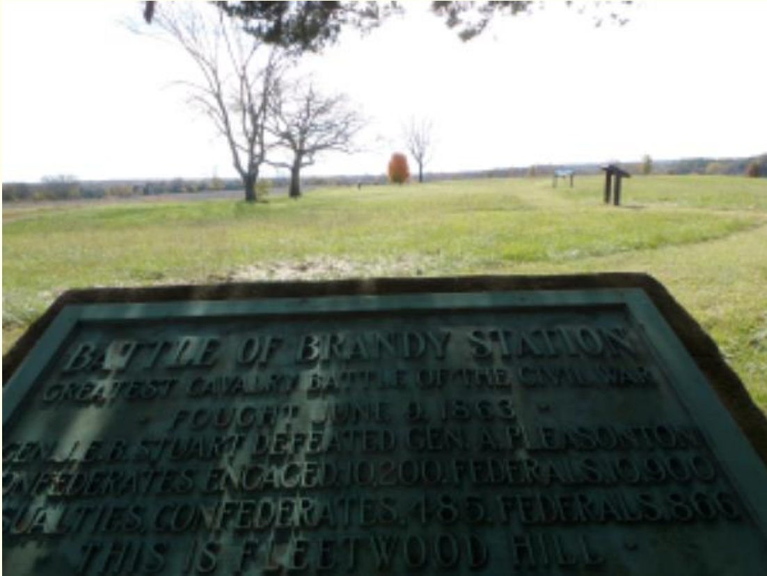
UDC marker on Fleetwood Hill with new interpretive trail in the distance