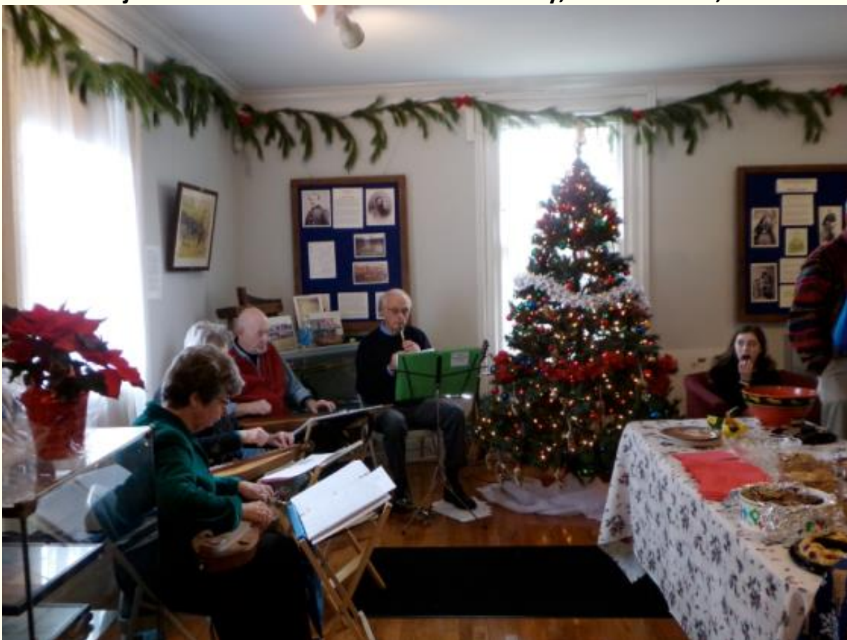
The Wilderness Run Players at the Holiday Open House at the Graffiti House in December 2014

Brandy Station Foundation Holiday Open House Please join us at the Graffiti House on Saturday, December 12, 1-4 PM